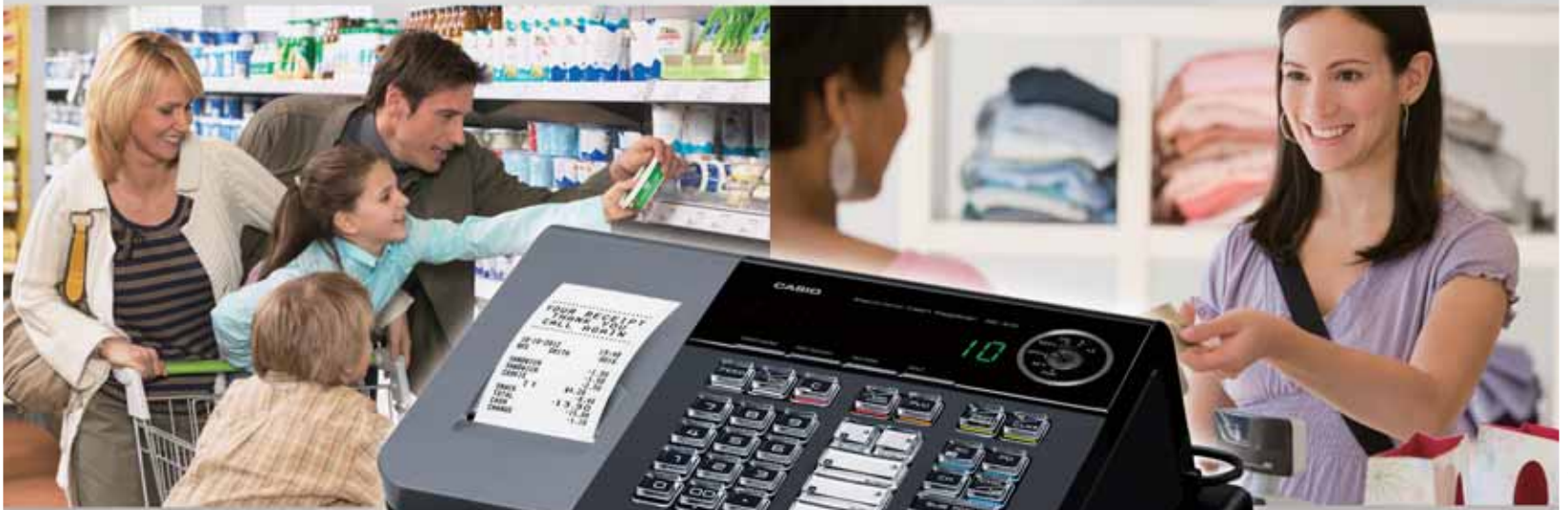
Small drawer model

The SE-S10 smart cash register combines convenience in setup and day-to-day operation with deluxe features such as a customer-friendly rear display and antimicrobial keyboard. This stylish, compact register suits any retail environment.